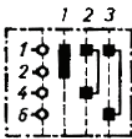
Typical 3 Step 0-1-2-3