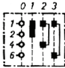
Typical 3 Step 0-1-2-3