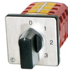
Front Panel Mount