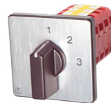
Front Panel Mount