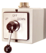
-S4 Enclosed T25

M65 Metal Enclosed with Molded Drip Shield, size Type D1 or VN2 only.