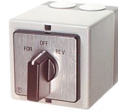
-S4 Enclosed T24