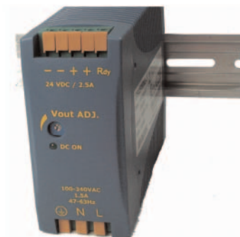
Din Rail Mount